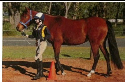
The aid for go forward is pressure on the lead rope in a forward direction.