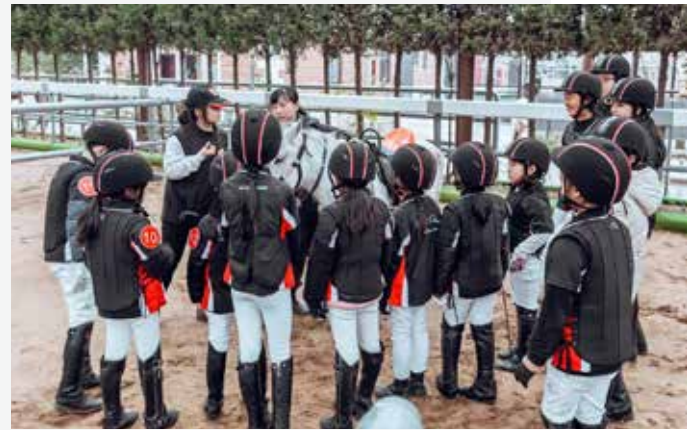
CPC colleagues giving horse handling lesson to a group of E level CPC riders in a member club.