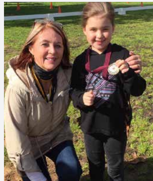
Volunteer of the Year