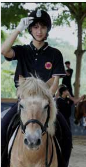
Equestrian major students of a TAFE being trained by CPC.