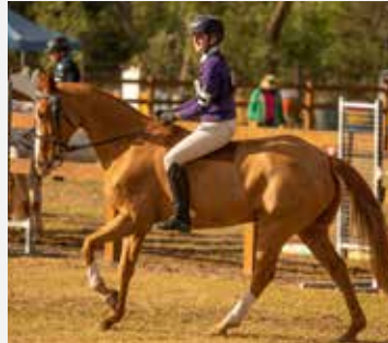
Best achievement, Rider 13-17 years