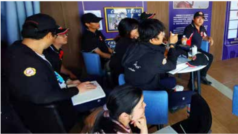
CPC staff having an online meeting with the coaches of a CPC member club.