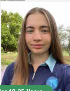
Best Achievement, Rider 18-25 Years