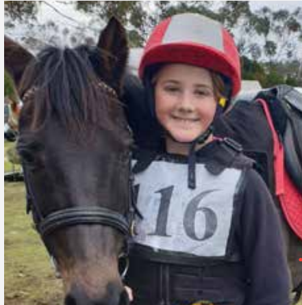
Rider of the Year 12 Years and Under