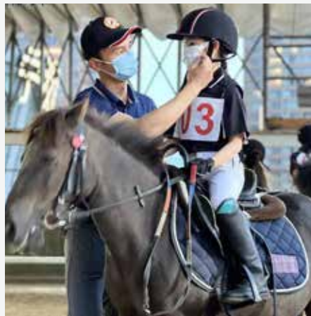
Riders participate in a proficiency level test in a CPC member club.