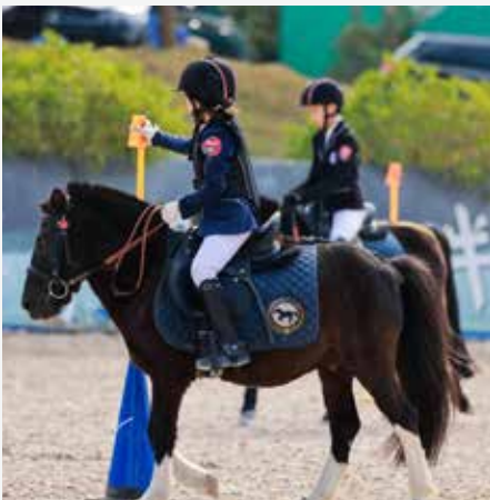
A Gymkhana held by CPC.