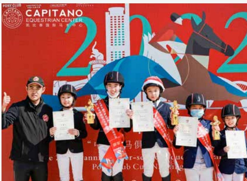
Award presenting at a Gymkhana held by CPC.

The good news is that at the beginning of December 2022, China finished the domestic pandemic control, and Chinese borders were gradually reopened after that.