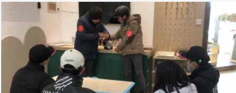
Two CPC coaches demonstrate using each farrier tool on a toy pony which is so professional but with a lot of fun