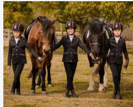
CPC riders at a Pony Club winter camp preparing to take rider proficiency level test.