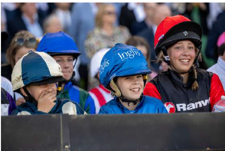
Moonee Valley: Excitement builds!

Moonee Valley Photos: Darren Tindall Photography