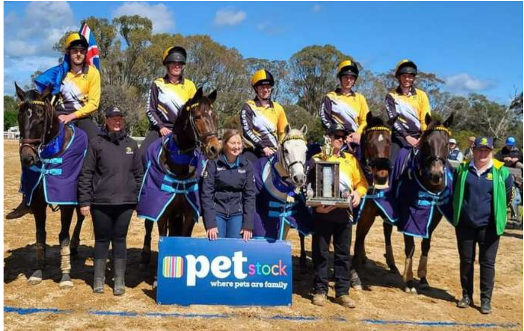
ABOVE: The WA Games team members reversed the trip, travelling to Benalla in Victoria for the Nationals Games hub. It was worth the trip, with the senior team taking the championship.