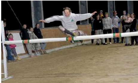
There were plenty of fun activities at the mounted games hub, and the indoor school at Benalla was put to good use in the wet conditions.