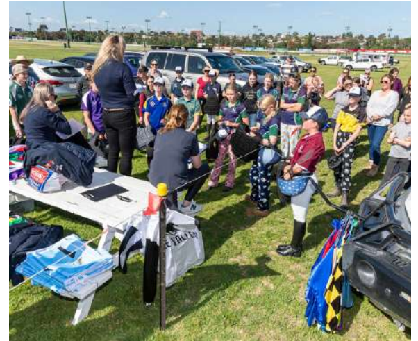
Moonee Valley - pre-race talk as the young jockeys get their silks.