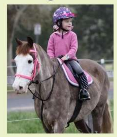
A dressage test usually asks for a long rein at some point. You maintain a soft contact and let the horse stretch down.