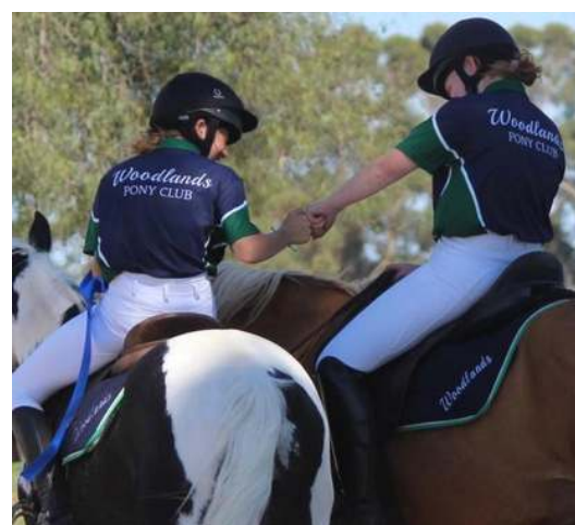
RIGHT: The merger of three Clubs is forging new friends and team mates.