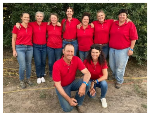
The Queensland Women's Masters Polocrosse team.