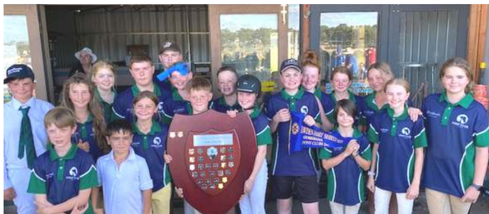
ABOVE: The new Woodlands Pony Club took out the Zone's prestigious Lowden Shield last month, at their first try.

The Lowden Shield provides competition in flat (show) riding, games and handymount.